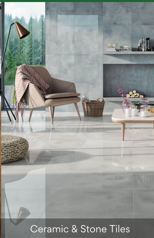
Ceramic & Stone Tiles