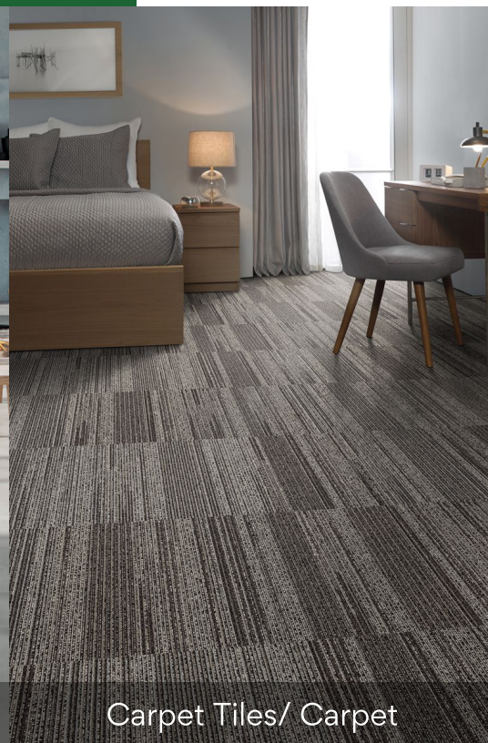
Carpet Tiles/ Carpet

InstaLay® is well-suited to many environments